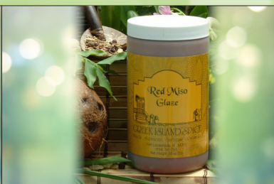
Red Miso Glaze Product # KG146 • Size 6 x 34 oz./case.

Sweet fresh mango, fresh multi-colored peppers and crisp onion come alive when complimented with a hint of citrus, ginger and mild Indian spices. May be used as a garnish, tossed into salads or be extended with fresh diced fruit as a quick salsa.