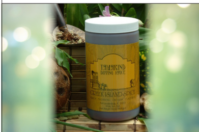
Tamarind Dipping Sauce Product # KH024 • Size 6 x 34 oz./case

An exotic blend of fresh lemon grass, ginger, chilies, coconut, lime leaves, tamarind and fresh curry leaves. Use it as a sauce base, marinade, in stir fry and soups. "An exotic blend of fresh lemon grass, ginger, chilies, coconut, lime leaves, tamarind and fresh curry leaves. Use it as a sauce base, marinade, in stir fry and soups."