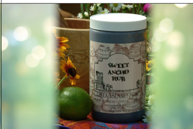
Sweet Ancho Rub Sauce Product # KG948 • Size 6 x 34 oz./case

A sweet and tangy tamarind base with deep tones of Jamaican hibiscus, delicately spiced. A perfect dipping sauce for dim sum or any Asian hors d'oeuvres as well as a salad dressing base.