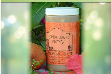
Tropical Mango Chutney Product # KF844 • Size 6 x 34 oz./case

Greek Island Spice line of condiments are produced with an emphasis on detail to producing the finest in fresh condiments and spices. Great attention is given to freshness, the quality of ingredients and consistency of product. Our condiments are specially created for high quality commercial application. These products are in concentrated form and are intended to be extended using a variety of readily available ingredients such as stocks, heavy cream, water, mayonnaise, sour cream, buerre blanc, honey, simple syrup, fruit and citrus juices, oils, butter, marmalades, coconut milk and vinegars.