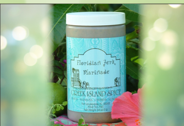
Floridian Jerk Marinade Product # KH018 • Size 6 x 34 oz./case

Miso, premium tamari and mirin, accented with fresh ginger, garlic and chilies. It's a versatile fish and seafood glaze that can also be used for stir fry, dim sum, soups, as well as a dipping sauce. Perfect glaze for grilled tofu.