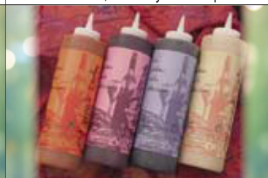
Gingered Papaya Coulis Product # KH366 Size 6 x 24 oz. / case

This deep purple coulis is flavored with soy, brown sugar and oriental spices to create a somewhat opaque coulis with a forward hibiscus flavor, perfect as a finishing sauce for any asian style preparation