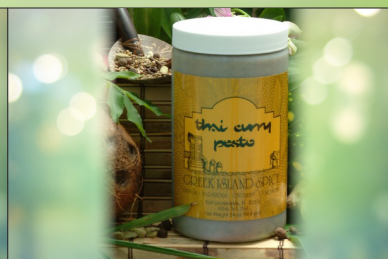
Thai Curry Pesto Product # KG804 • Size 6 x 34 oz./case

A true "taste of Florida" is achieved by combining the island flavors of a traditional jerk with the distinct aroma and flavor of citrus and coconut. Slightly sweet, not as hot as the Caribbean Marinade.